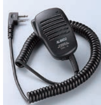
● Microphone (EMS-76)