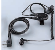
● Earphone Microphone (EME-56A)