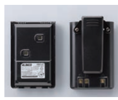
● Li-ion Battery (EBP-87) DC 7.4V 1500mAh